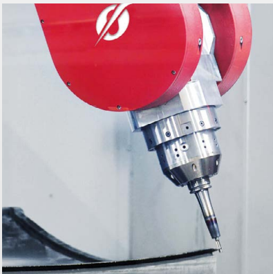
CNC MACHINING CENTRES