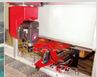
Carousel tool change 18/24/30 pockets