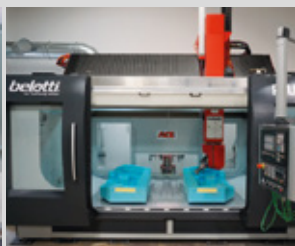
Resin model milling