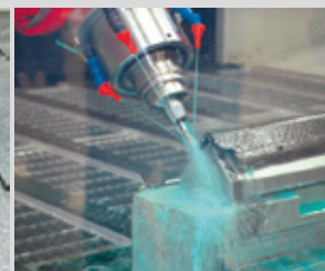
Wet carbon fiber machining with coolant