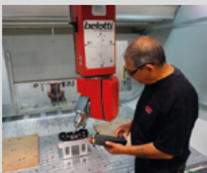
Carbon fiber machining

Spray mist cooling system; Heidenhain linear measuring system; 30-position chain tool changer; 22 kW electrospindle at maximum 24.000 rpm and direct drive encoder; high or low pressure liquid coolant systems